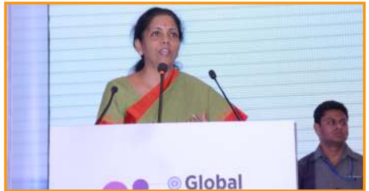
Smt. Nirmala Sitharaman

Minister for Communications & Information Technology and Law & Justice, Government of India in GES 2016