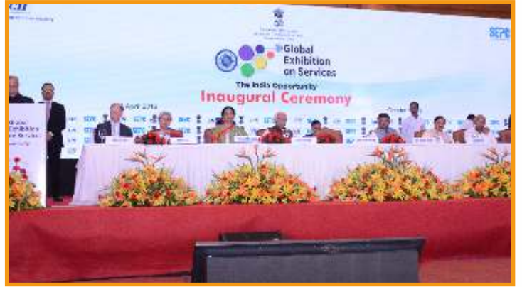
Inauguration of GES 2016 by Hon'ble President of India, Shri Pranab Mukherjee on 20 April, 2016