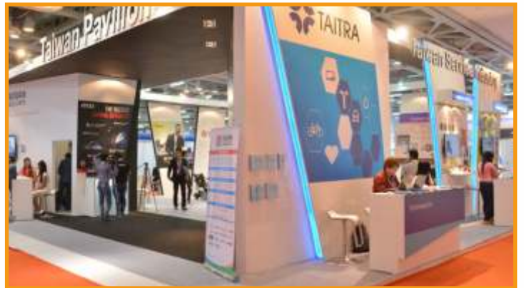
Exhibition Showcase in GES 2016