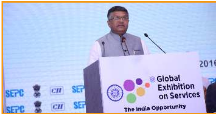
Sh. Ravi Shankar Prasad

Minister for Communications & Information Technology and Law & Justice, Government of India in GES 2016